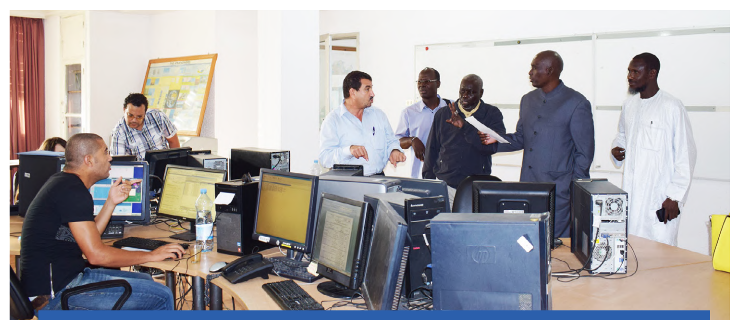
Through these services, CODEV International supports national and subnational governments to transform their development path to a lowemission and ecologically sustainable future.

Mainstreaming climate change in planning and decision making processes is a crucial tool to ensure climate change adaptation. This approach involves taking into account risks and opportunities while putting in place adaptation measures that are attuned to the long-term vision of development.